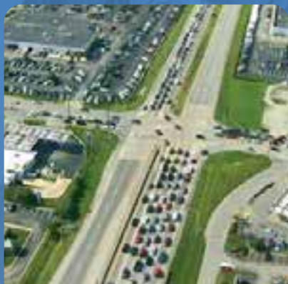
This congestion at the intersection of 96th Street and Keystone Parkway will be remedied with a new interchange.

Carmel's road projects are always done in the most efficient manner while maintaining safety for road construction crews. We appreciate the patience of the motorists as they make their way through areas of construction.